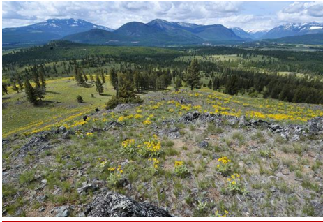
Wycliffe